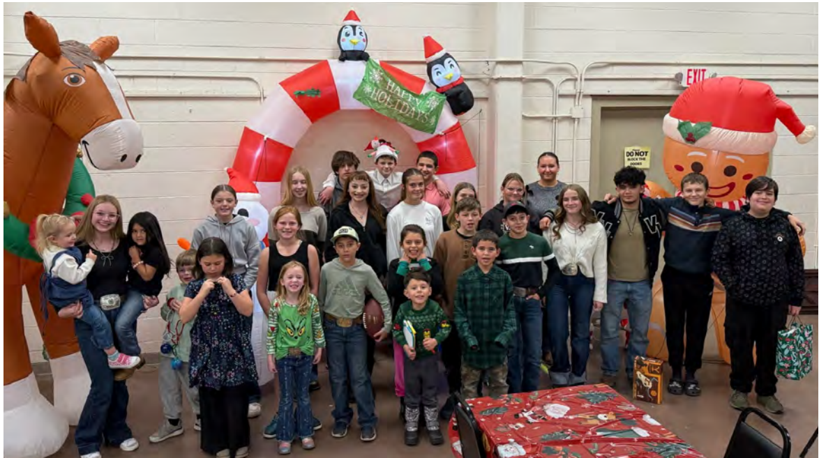
County Wide Christmas Party and Community Service December 4, 2025