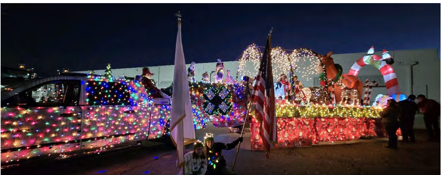
Mountain Heights 4-H Club Twinkle Light Parade Float December 5, 2025