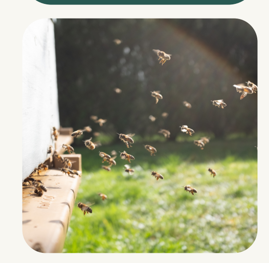
Bee a Good Keeper