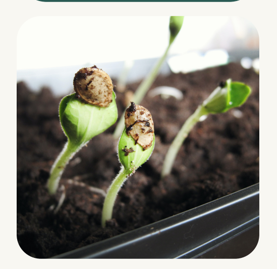
Seed-Starting & Nursery Management