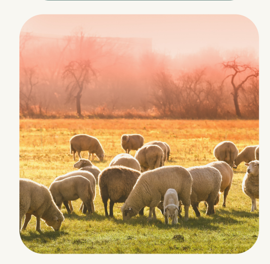
Small-Scale Sheep Keeping