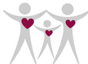
FAMILY & CONSUMER SCIENCES